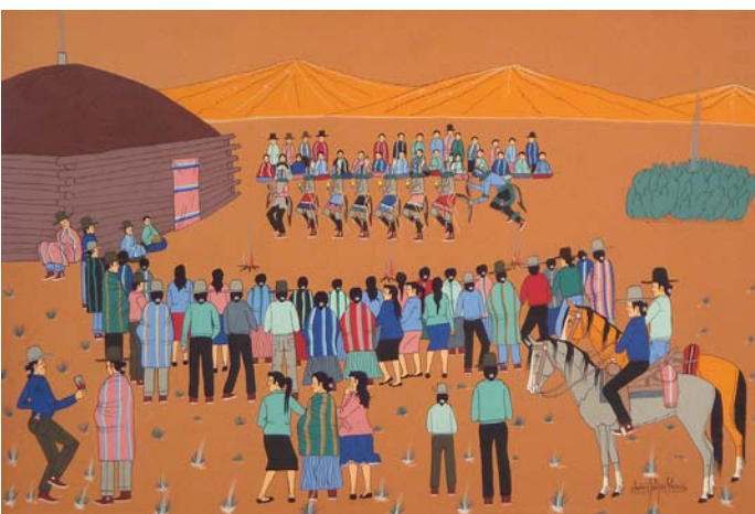
Top image: Ralph Roybal (San Ildefonso) Rainbow Dancers Faculty Office area (3rd floor)

The cultural practice of Native American ceremonies and rituals is believed to bring order and balance to the tribal community and, by extension, the world. Images that depict aspects of these ceremonies and rituals are often filled with the nuances of indigenous cultural aesthetics reflective of tribal beliefs and customs. For many communities, the beauty of the dance can be seen in the affective visualization of the step – serving as synecdoche, or a part representing the whole, for both the physical dance and the accompanying rhythm and beat of the drum or singer's voice. Participation in ceremonies perpetuates the dynamic nature of tribal cultures, extending the life of the culture through its active practice, and provides a means for tribal members to affirm their individual identities. Tribal artists may opt to document a particular event or they may choose to depict the essence of the ceremony through abstraction. The range of images presented in this theme reiterate the importance of these cultural practices for both participant and viewer. These images of ceremony and ritual are also the place where Indigenous artists are most likely to depict the human figure, necessary as the activating force centrifugal to the event pictured.